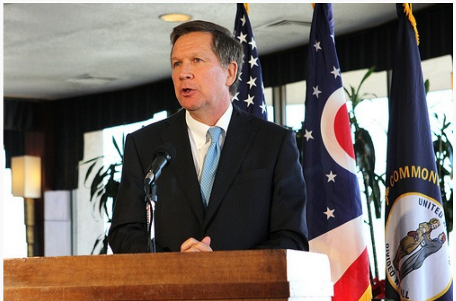
Ohio Governor John Kasich

Another Republican in trouble this week is New York Representative Michael Grimm, who threatened to throw a local reporter off of a balcony after the State of the Union on Tuesday.