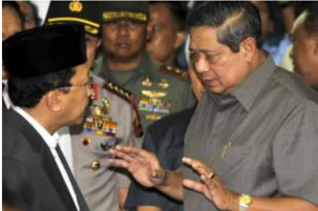
President Susilo Bambang Yudhoyono talks to Governor of Jakarta Fauzi Bowo at a hospital after visiting injured bombing victims on Friday.

By the presence of visual aids, it would certainly draws the reader's attention and thus immediately set up the frame discussed in the previous. Otherwise, in fact there is a mismatch between the headlines with the picture as well as between the descriptions of the image with the image itself. As it has been known that the headline reads "SBY's Speech on the Jakarta bombings" then the picture must show SBY who is giving a speech or circumstances post the explosion occurred. While the description under the picture explains that SBY was in the hospital but the picture does not show the specifics.