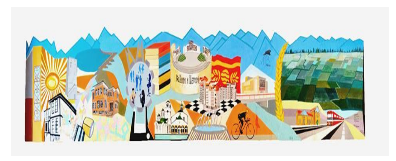
Figure 4. Children's park

Exposition plate can be vertical (wall), horizontal or inclined (special cupboard). Vertical plane is more suitable for mural, zgrafito and relief.