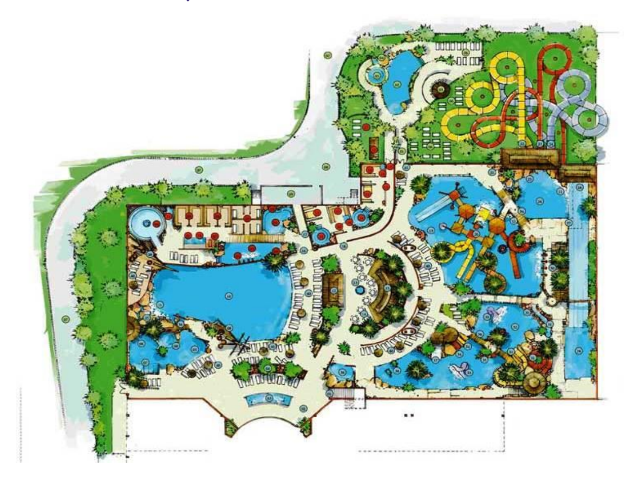
Figure 1. Children's park

Journal of the Faculty of Technics and Technologies, Trakia University https://sites.google.com/a/trakia-uni.bg/artte/