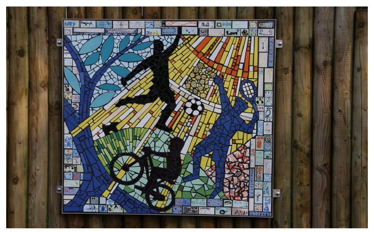
Figure 5. Children's park

Journal of the Faculty of Technics and Technologies, Trakia University https://sites.google.com/a/trakia-uni.bg/artte/