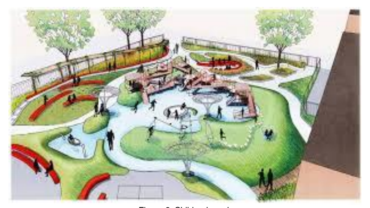
Figure 2. Children's park

Usually, the selected theme should be in accordance with a functional purpose of the zone in the children's park.