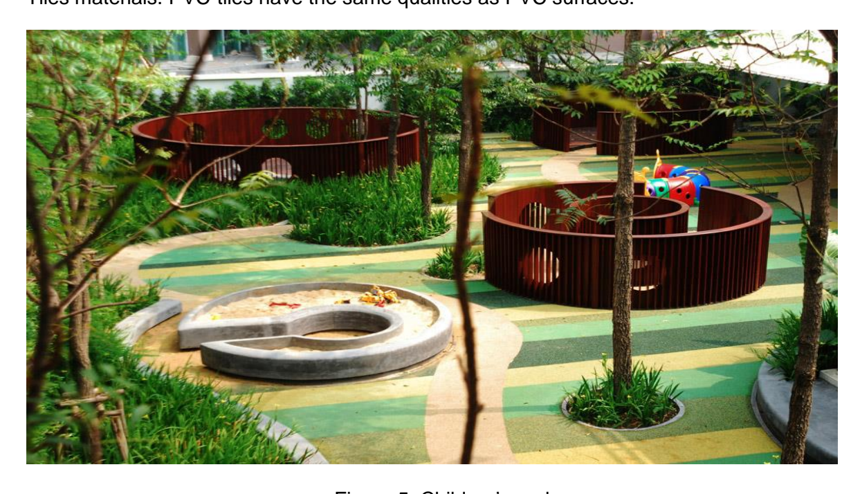
Figure 5. Children's park

The foundations of the pathways and surfaces for playing have functional and aesthetic role. They are too big surfaces in the enterier and are basic carrier of color. On their background, the entire design of children's toys is designed, it is a design of urban equipment. Tiles materials. PVC-tiles have the same qualities as PVC surfaces.