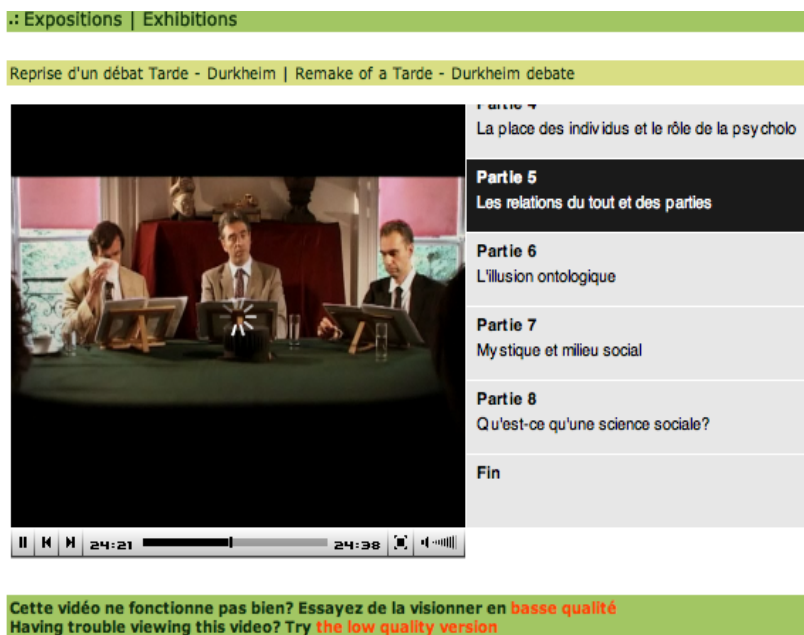
Figure 5. The Tarde/Durkheim 1904 debate replayed in Paris. http://www.bruno-latour.fr/expositions/debat_tarde_durkheim.html

My claim, or rather ANT’s claim and that of the revisited tradition dating from the great French sociologist, Gabriel Tarde, at the turn of the 19th century, is that the very idea of individual and of society is simply an artifact of the rudimentary way data are accumulated (Figures 5 and 6). The sheer multiplication of digital data has rendered collective existence (I don’t use the adjective social anymore) traceable in an entirely different way than before. Why? Because of the very techniques that you, Ladies and Gentlemen, have brought to the world.