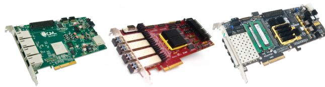
Figure 1: NetFPGA: the enabling platform of OSNT

production network, the equipment is tested regularly. Throughout the process, a relentless battery of tests and measurement help ensure the correct operation of the equipment. This has led to a multi-billion dollar industry in network test equipment giving rise to companies such as Ixia, Spirent, Fluke, and Emulex/Endace among others.