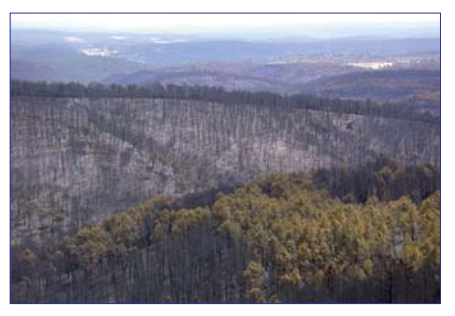
Details of a large forest fire (12.000 ha), started in Riba de Saelices (prov. of Guadalajara, Spain), on July 16^{th} , 2005, as a result of negligence. When the fire broke out, at 2 p.m. the FWI had a value of 66.6, which exceeded the 95-percentile of the historic series. The fire raced through some rugged terrain, burning a mixture of old and young pine woodlands and shrublands, and caused 11 deaths among firefighters.

greater the coefficient, thus the more unequal the size of fires. Most cells (88%) showed high Gini coefficient (>0.5), meaning high inequality in fire sizes, whereas few (12%) cells presented values under 0.5, which means more equality in the distribution of fire sizes. Greater inequality in the size of fires means that more large fires occur. These fires are the ones with greater catastrophic potential and cover most of the area burned per year. Therefore, increases in FWI can severely impact Spanish landscapes by changing the proportion of large fires.