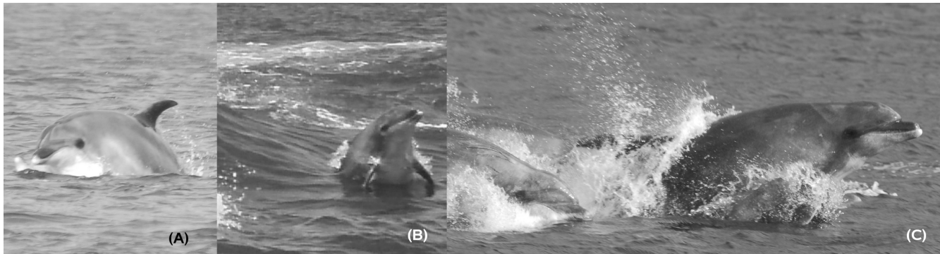
Figure 1. Common bottlenose dolphins in (A) Temuan Channel, 44°45'.058S, 73°42'.871W, on 12 January 2007; (B) Daye Point, 43°08'.570S, 72°54'.86W, on 20 December 2007 and (C) Vera Sound, 45°05'.597S, 73°19'.996W, on 13 January 2007.