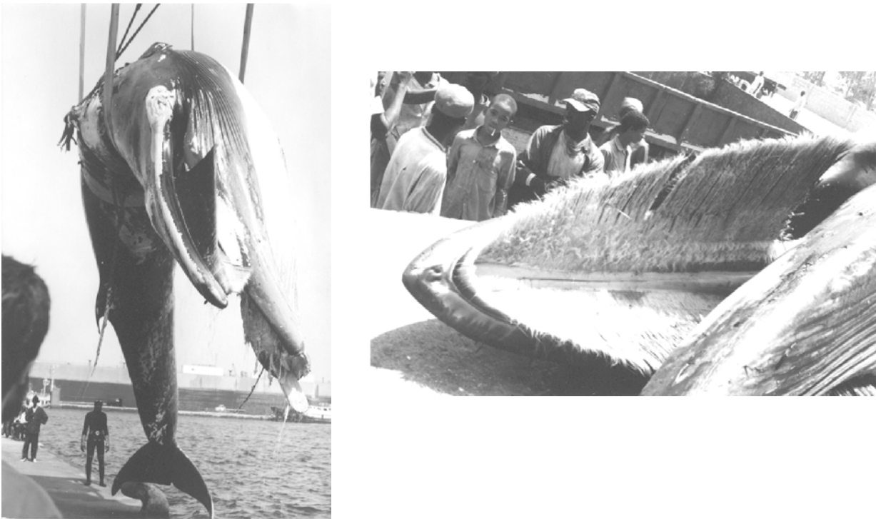
Figure 3. Young sei whale brought into Dakar port, Senegal, on 23 March 1998, on the bow of the German container ship OSNA Bruck . A full set of baleen still in the palate, mostly intact skin and the lack of bloating suggested that the whale had died within the past two days, presumably from impact with the vessel.

On Monday 23 March 1998, the Dakar daily Le Soleil published a photo of the whale draped over the ship's bow bulb and reported that it was struck close to Gorée Island, a few nautical miles off Dakar. However, according to the captain of the OSNA Bruck , the ship had departed Las Palmas, Gran Canaria, Canary Islands, some two days earlier and the crew became aware of the dead whale only after passing Gorée Island. The captain indicated that the collision may have occurred earlier, en route from Las Palmas.