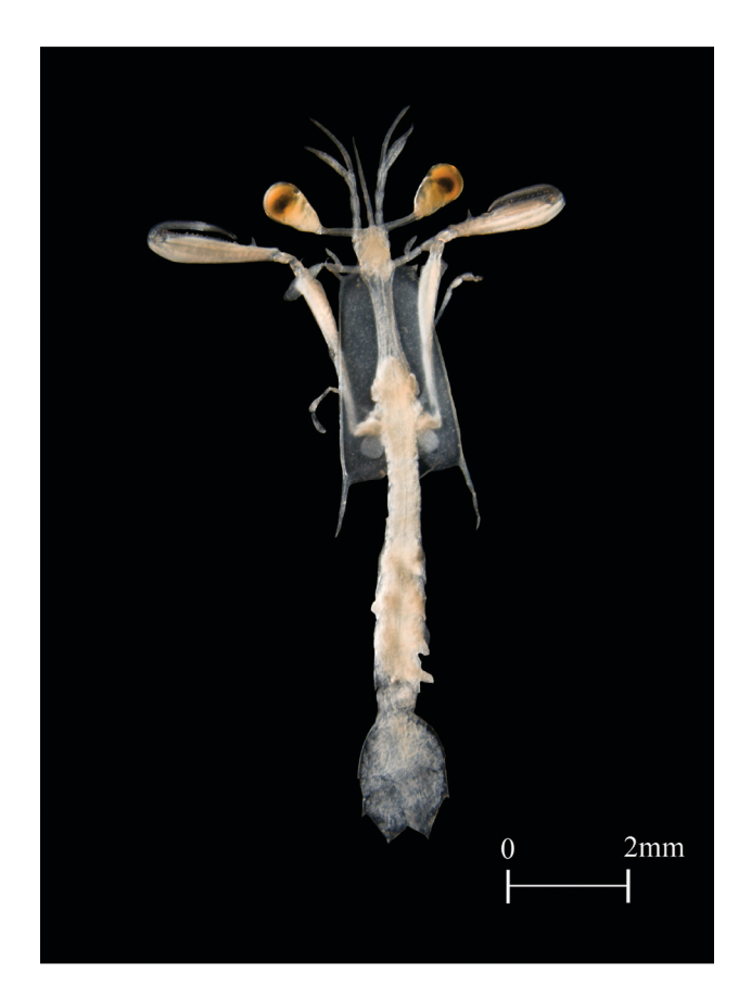
Fig. 1. – Picture of the 6<sup>th</sup> stage megalopa larva of Rissoides desmaresti (specimen 1).

In Belgian waters, adults have so far never been recorded (12). However, Stomatopoda larvae were collected by G. Gilson during the European ICES (International Council of the Exploration of the Sea) campaigns between 1902 and 1913 (Gilson collection, largely preserved at the Royal Belgian Institute for Natural Sciences (RBINS)