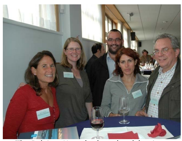
The Belgium Kustatlas launch celebration during ICAN 5