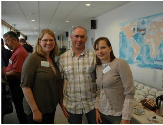
Catching up with old friends