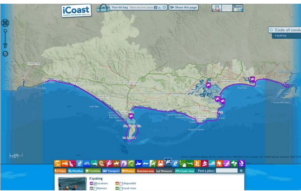
Figure 3: Homepage of the Dorset iCoast website with the location of kayaking areas highlighted

iCoast has been developed to allow visitors and local people to plan recreational activities along the Dorset coast and within coastal waters. It also allows "soft" management of visitors by promoting less sensitive areas, such as fossil hunting, and raising awareness of sensitive areas and affecting behaviour. It contains data on the locations of recreational activities / businesses / clubs, transport, weather (forecast and live), facilities and restricted access areas / sensitive habitats. Additionally it contains activity information - how, where, planning, safety etc and "Codes of Conduct" - to ensure people use the coast in a sustainable way. It was developed with a commercial partner.