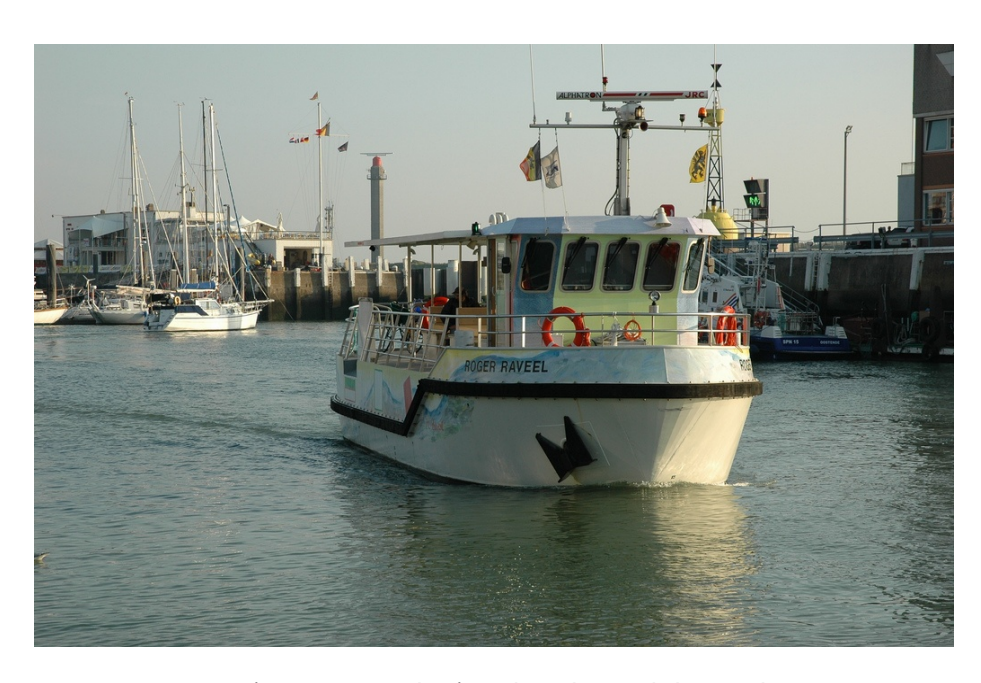
More information can be found on the workshop web site: http://ican.science.oregonstate.edu/ican5