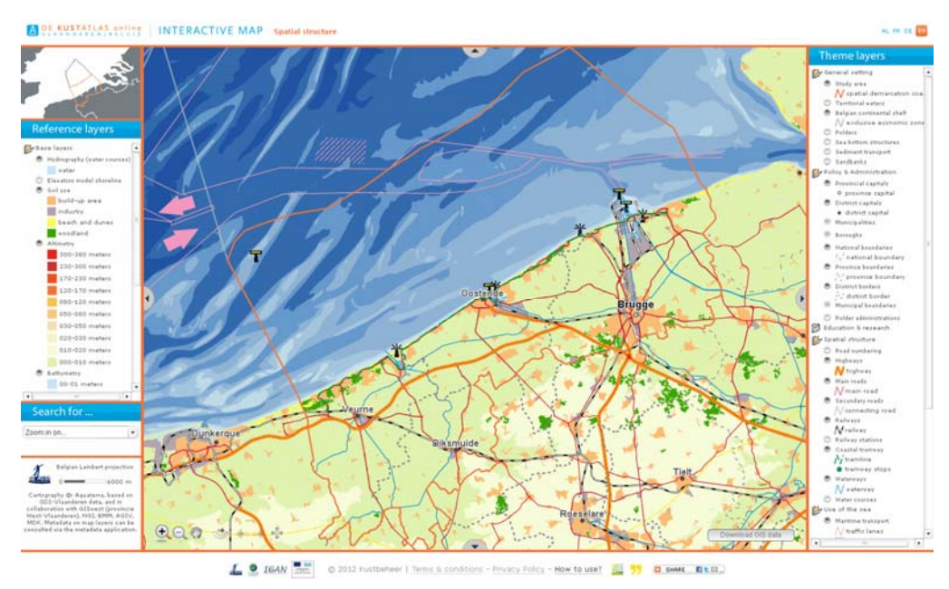
Figure 1: Interactive web GIS within the Belgian Coastal Atlas

The target audience of the Belgian Coastal Atlas is wide and includes coastal stakeholders, scientists, policy and decision makers, educational users, public users and (marine) industry.