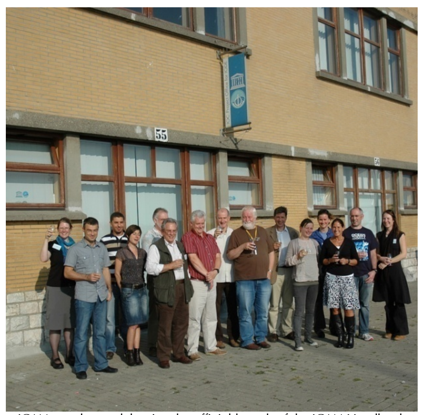
ICAN members celebrating the official launch of the ICAN Handbook

Discussion in this session examined if ICAN objectives were being achieved and if the working groups could improve their support of these objectives. Evidence of ICAN success to date related to the large and representative membership, the publishing of the ICAN Handbook in 2010, the support given by the EU funded NETMAR project to advancing interoperability, the large number of workshops, meetings and events organised by or with participation of ICAN members, and the sharing of software and know-how between members.