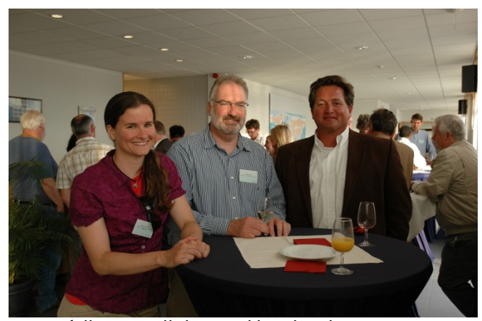
ICAN folk at a well deserved break in between sessions