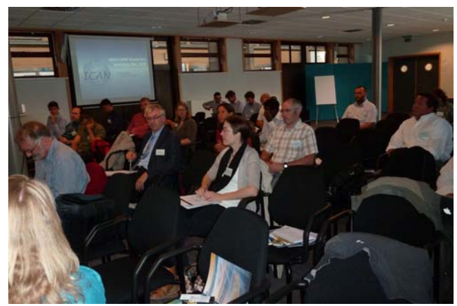
ICAN session about to start

This workshop report has an accompanying web site at <a href="http://ican.science.oregonstate.edu/ican5">http://ican.science.oregonstate.edu/ican5</a> from which the reader may download all PowerPoint files presented at the workshop, as well as working papers and prior reports, breakout group notes, photographs, and links to related web sites.