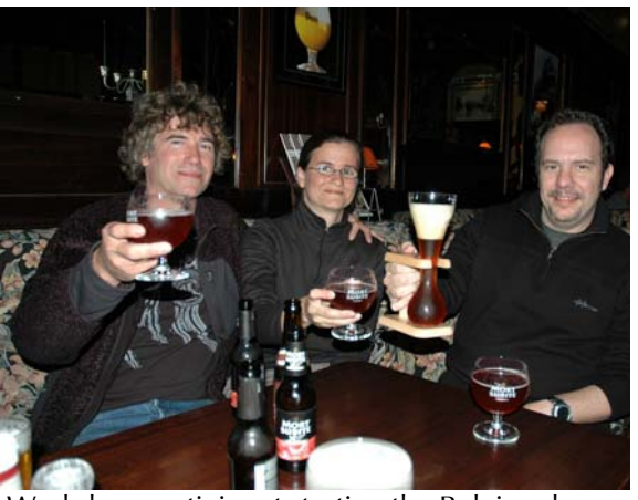
Workshop participants testing the Belgium beer