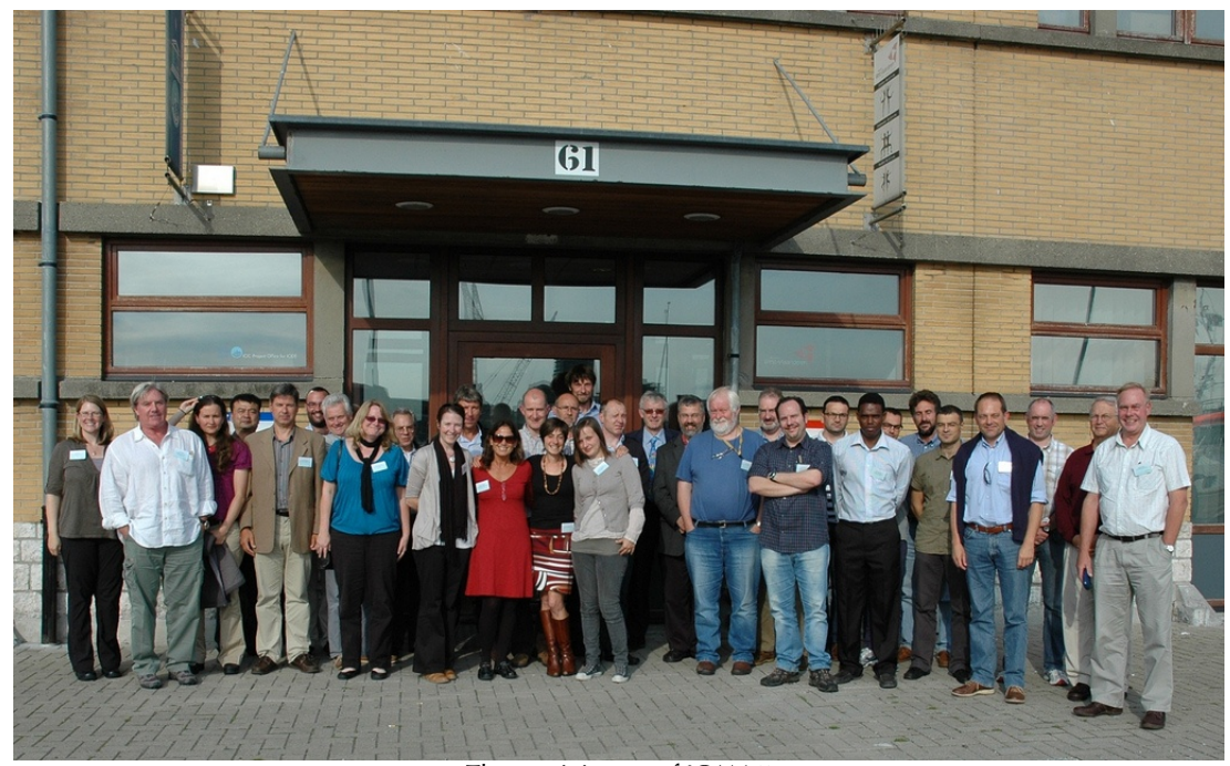
The participants of ICAN 5

The IODE ICAN Pilot Project is a precursor to the establishment of a full IODE ICAN Project which will be proposed to the 22<sup>nd</sup> session of the IOC Committee on International Oceanographic Data and Information Exchange (IODE-XXII) in March 2013. In the coming months the existing ICAN working groups will draw up and propose a work programme for the period 2013-2015. The terms of reference for the IODE ICAN Pilot Project are available on the IODE website at: