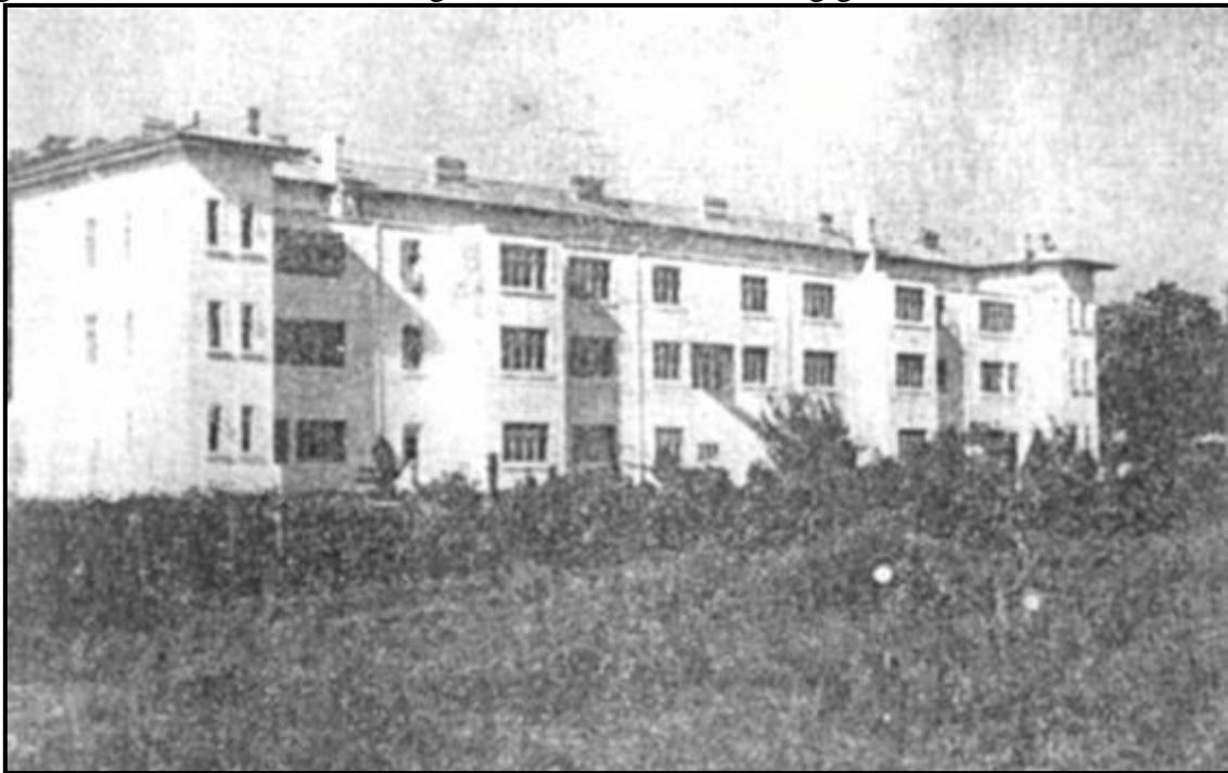
Figure 1 The Marine Zoological Station I. Borcea at Agigea

More than a century ago now, Adrien de Gerlache (1866-1934), the Belgian Naval officer leading the Belgica Antarctic Expedition invited Emil Racovitza (1868-1947), a biologist, to turn his attention to the sea. From this, Racovitza became the founder of Romanian oceanography. In turn Racovitza motivated two other Romanian scientists, Professor Ioan. Borcea (1879-1936) the zoologist, and Dr. Grigore Antipa (1867-1944) the marine ichthyologist, to dedicate their work to the development of marine sciences in the Black Sea and Mediterranean.