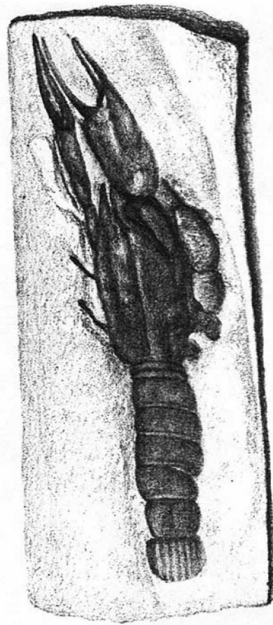
Fig. 4. Electronic copy of the original illustration of Axius fontannesi A. MILNE-EDWARDS in FONTANNES, 1885 (pl. 1, fig. 2), Pliocene, Département Drôme, southern France.

Description: Carapace smooth, dorsal surface strongly convex, unornamented median anterogastric carina in anterior half; faint, short, unornamented submedian supraorbital carinae. Cervical groove well developed, reaching antero-ventrally to hepatic region. Anterolateral margins smooth. Pereiopods 1 clearly unequal and devoid of spines; major one with short, curved dactylus and fixed finger, both with a