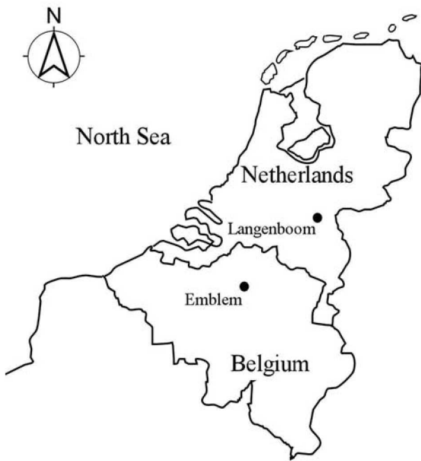
Fig. 1. Schematic map of Belgium and the Netherlands, showing the localities of Emblem and Langenboom.