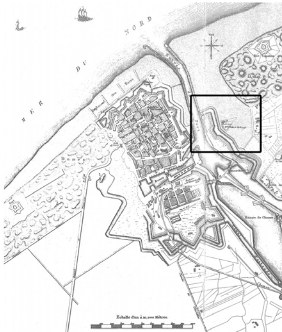
Topographic map of Ostend, showing the location of the 19 th century world's first marine station, the oyster farm Valcke-Deknuyt and the present InnovOcean site

farms (“huîtres”) ensured him of a constant supply of fresh study material. As an illustration of the hard work being carried out at the Ostend facilities, he published a series of articles, entitled: ‘Recherches sur la faune littoral de Belgique.’