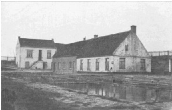
The world's first marine station at Ostend: the 'Dune laboratory' in the oyster farm of Valcke-Deknuyt