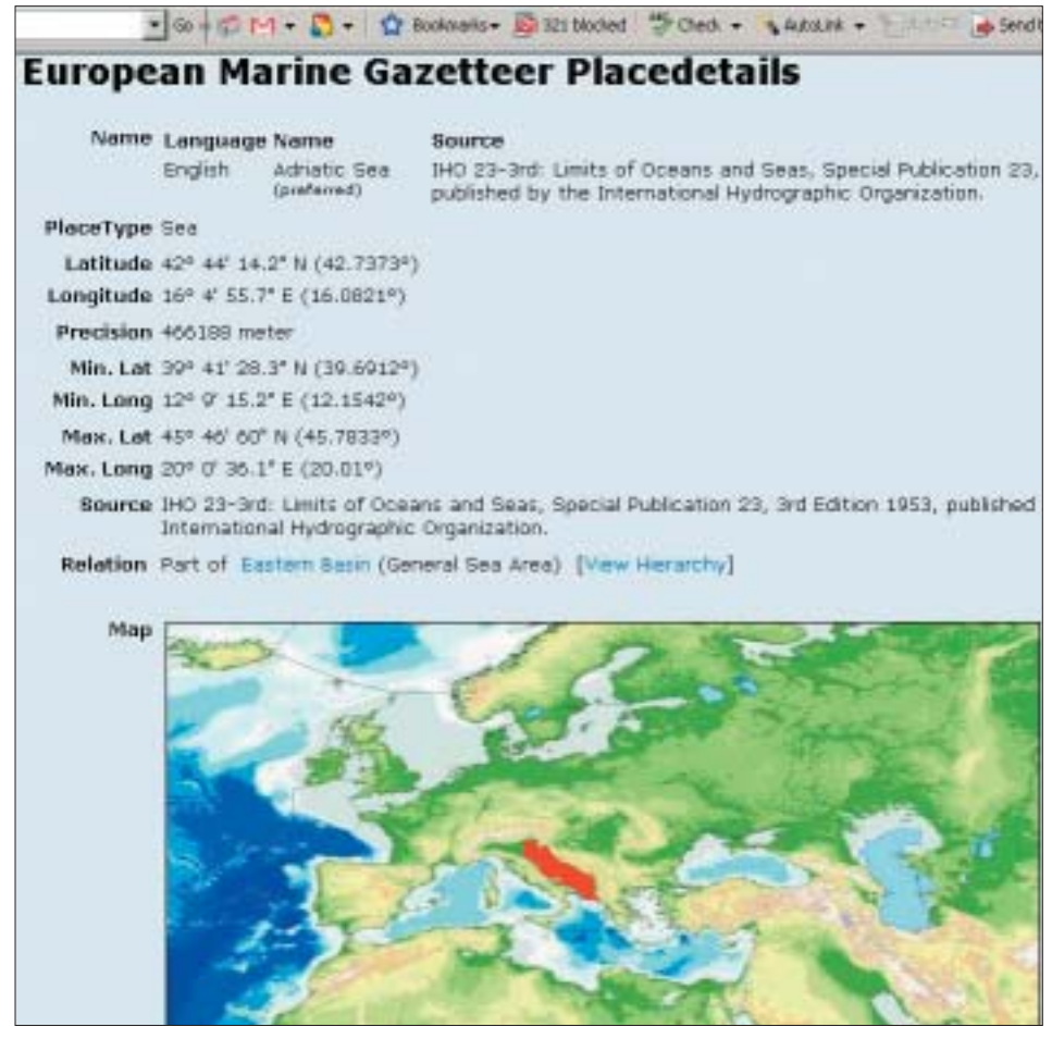
The gazetteer contains coordinates, sources of information, precision and relations. A dynamic map provides a visual interface.

and links with available shapefiles. This relational structure allows for browsing through a hierarchical tree - comparable to browsing through the taxonomic classification of the European Register of Marine Species (ERMS) – and enables the user to list all places located in a particular area. Important sources of information are: the International Hydrogeographic Organisation (IHO) Limits of