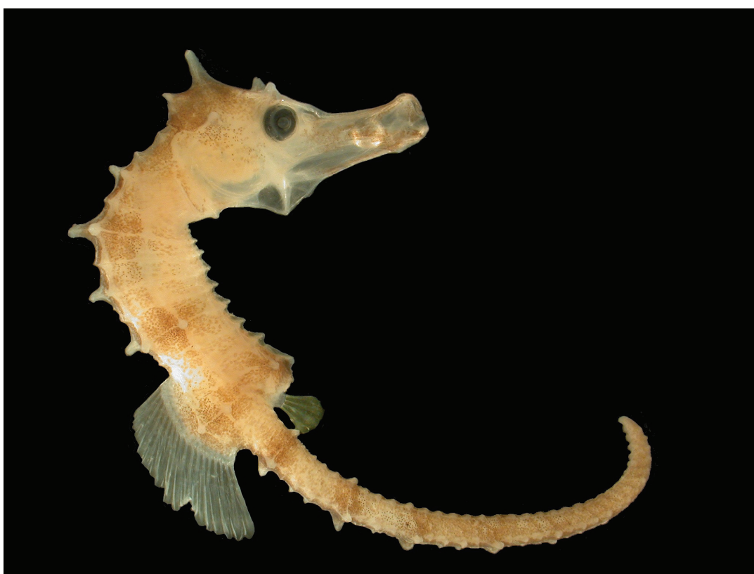
Juvenile long-snouted seahorse