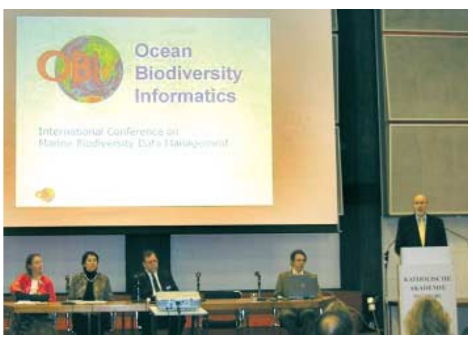
Conference opening ceremony.

Flanders Marine Institute (VLIZ) acted as conference secretariat, and the German Federal Maritime and Hydrographic Agency (BSH) was the local organiser. Funding was provided by the German Federal Ministry for the Environment, Nature Conservation and Nuclear Safety, by the EU through the MarBEF