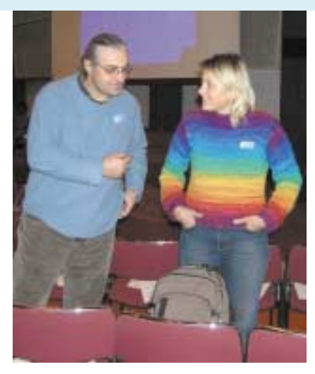
Participants at the OBI conference.

NoE and directly through support of participants, and by the World Data Centre for Oceanography in Silver Spring, Maryland, US.