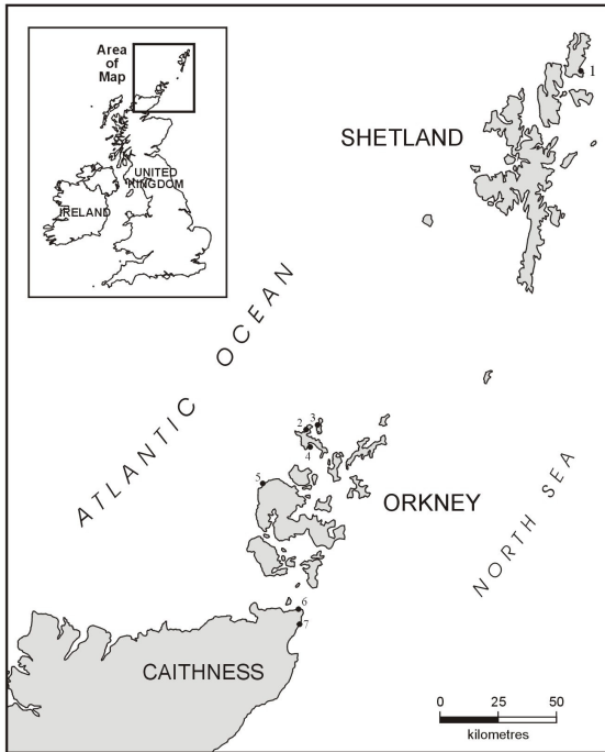
Fig. 1. Location of Quoygrew (2).