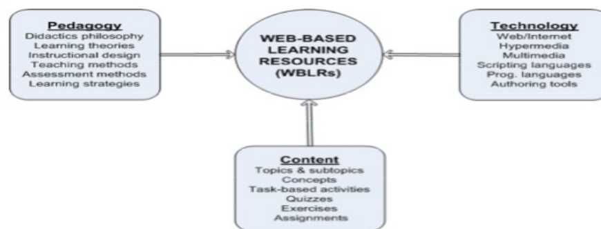
Figure 1: Online learning resources: Main characteristics (Hadjerrouit, 2010, p.117)

In accordance with the above described features, OLRs can be viewed from 3 perspectives: technological, pedagogical and from the perspective of content (Figure 1).