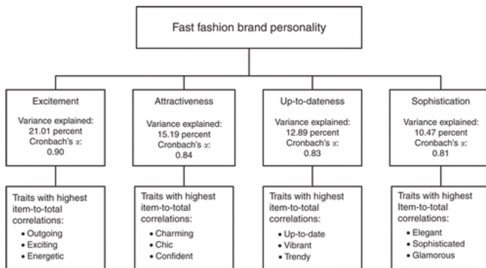
Figure 2. Structure of fast fashion brand personality