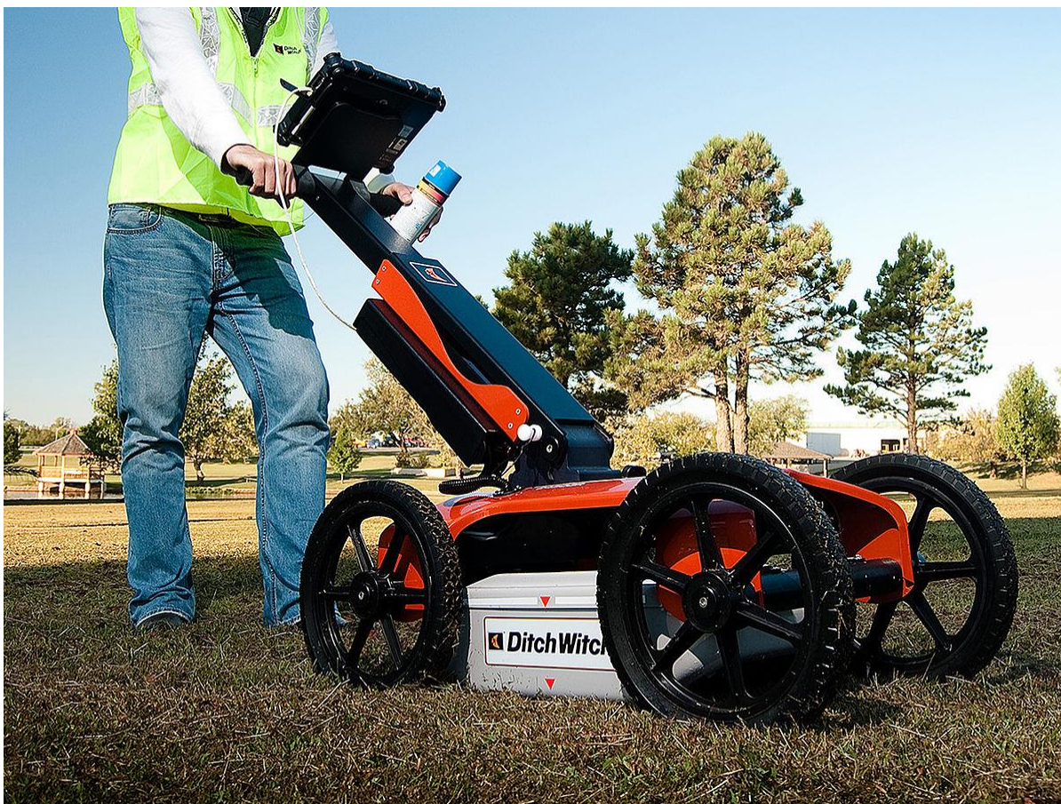
(Fig. 1) Man using GPR displayed on a push cart.

have greater depth penetration. Likewise, longer wavelengths have a higher resolution but lower depth penetration (Schultz, Collins, & Falsetti, 2006). The antenna frequency depends on the preferences of the researcher, expected burial depth, and type of objects one is attempting to detect (Goldberg & MacPhail, 2011).