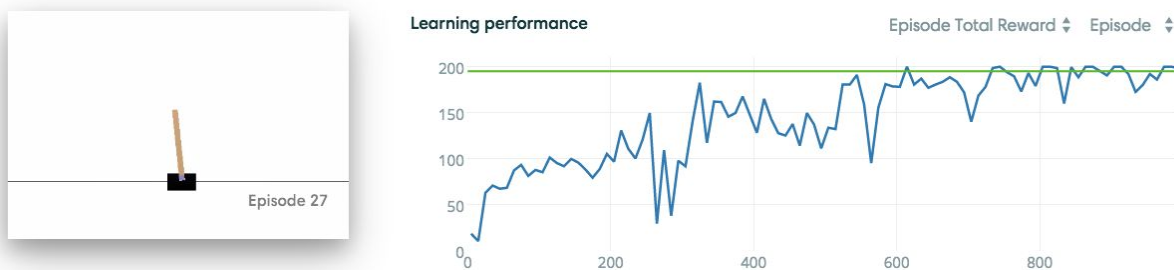
Figure 4. CartPole-v0 results. (Vilches, 2019)

The results saw substantial improvements over early generations, breaking the threshold for learning performance required in order to be seen as having successfully solved the problem by episode the 600th generation, at which point the rate of improvement between generations dips and recovers but doesn't see substantial improvement anymore before the algorithm reaches the end.