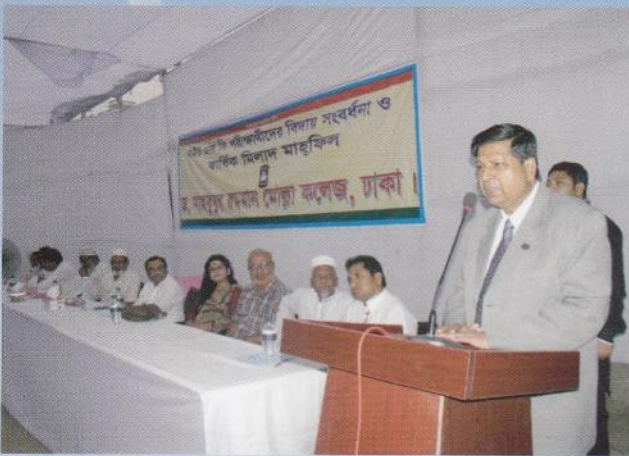
VC attends farewell at Dr. Mahbubur Rahman Mollah College