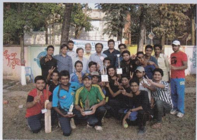
Inter-batch Cricket Tournament of FBA