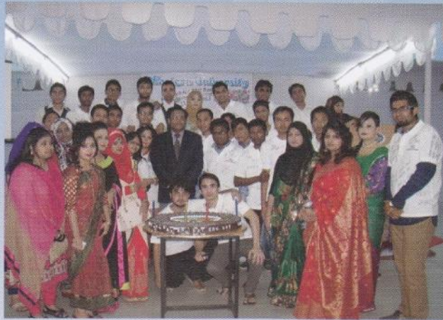
Faculty of Law bids farewell to graduating Students of LL.B.