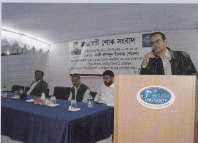
In memory of the late student of BBA