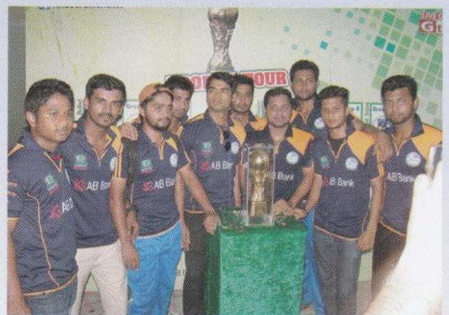
EU participates at Indoor Cricket Tournament and the Trophy Visits Eastern Campus