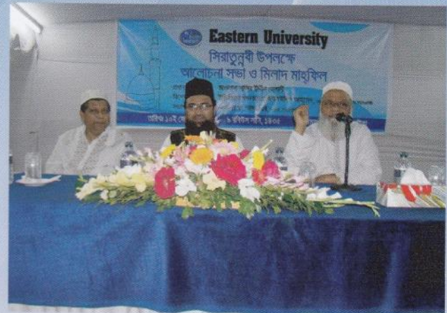
EU observed Sirat-un-nabi