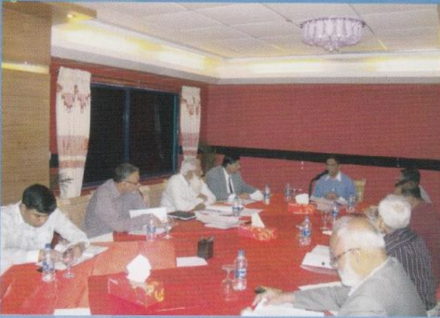
Annual General Meeting of EU Foundation