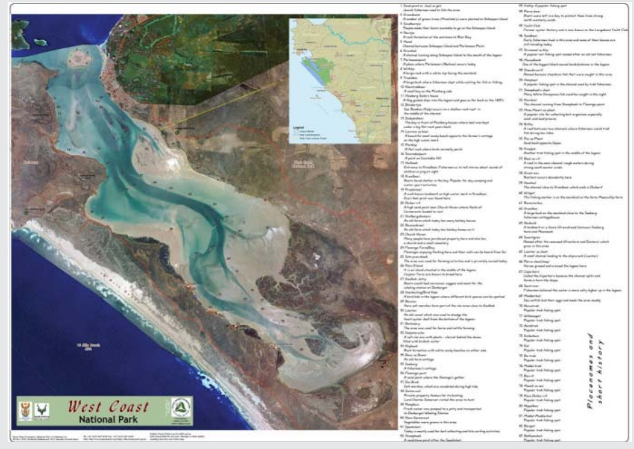
(Case example and map provided with kind permission by Pierre Nel, WCNP 2013)

In the Langebaan MPA within the West Coast National Park, the MPA has actively included persons from a local fishing family in documenting the cultural histories of the fishing communities in the Park.