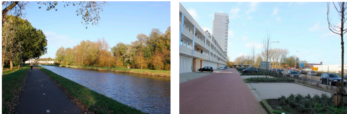
Figure 2. Impressions of green spaces in the two neighborhoods: Green space next to the highway in Corpus-Noord ( left ); and the highway next to the residential area in De Hoogte ( right ).

side of the neighborhood. Corpus-Noord also contains three main obstacles. A canal together with a highway are adjacent to the east side and another highway is on the northern side of the neighborhood. When looked at in more detail, the canal and the highway in Corpus-Noord maintain a suitable distance from the residential areas. A paved cycling road alongside the canal allows people to access the green spaces and it also provides a good recreational experience for visitors (Figure 2). By contrast, both the highway and railway in De Hoogte are very close to the houses and there are no facilities for them to be traversed, which makes it very difficult for residents to visit the green spaces on the other side of the highway and railway even though physically the green space is nearby.