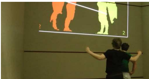
Figure 4. A player trying to make themselves as big as possible