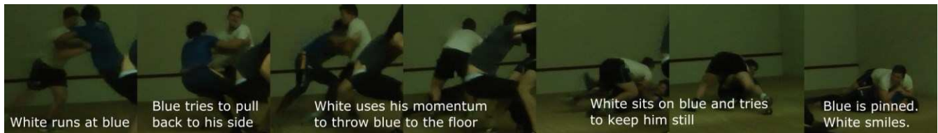
Figure 6. White player dominates blue, throwing him to the ground and sitting on him (and shows his enjoyment with a big smile)

Participants suggested that a lot of the enjoyment of brutal games comes from the opportunity to physically dominate other players (see e.g. Figure 8). “Knowing that, that you’re stronger than someone else if you sort of hit in attack or if you run through them there’s a sense of like ‘oh cool,’” “you don’t want to be the person who gets put on the ground, so, yeah, the person who puts people on the ground,” “even though if you didn’t win the game, it’s like, you know, it’s just little victories throughout the game, it’s like, you know, you actually manage to like tackle someone, get them down, it’s like ‘yes, I’m stronger, I have the better technique.’” Our interviews suggest that the enjoyment of brute force games comes not only from the rare opportunity to feel and use your own strength, but also from a sense of competition and opportunity to dominate other players physically.