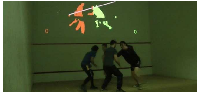
Figure 2. Players face off in Balance of Power.

Players must try and force the other team onto their side of the court. As players come over to one side, the balance tips towards that side. At random intervals of 10-30 seconds, a countdown of 5 seconds occurs. When the countdown ends, the team with the balance on their side scores a point; if the balance is in the middle, a ‘Balance of Power’ occurs, and no one scores. The first team to score 3 points wins. There is one final gameplay event, which occurs instead of a score countdown approximately 20% of the time, which is a ‘swap sides’. When a swap sides occurs, the side of the court that players ‘own’ swaps over, and they must try and get the opposing players to their new side instead.