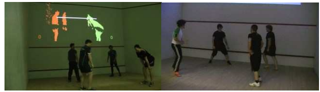
Figure 5. Self-organising at breaks in BoP and Bundle

Participants in every interview session discussed tactics used in the previous game play session and speculated on the role of teamwork in succeeding. This was particularly evidenced in the discussion of BoP, “teamwork is obviously really important like, if one of your team gets grabbed, you should grab your teammate and try and like pull him back, it's almost like, two people is better than one,” “every time we saw someone like come across, we'd both try and jump on them,” “focus on one person, get him down,” “it literally takes your entire team effort to pull someone across.” Participants also mentioned the importance of the social pressure in competitive team games in driving performance and endurance, “it's definitely what keeps me going in