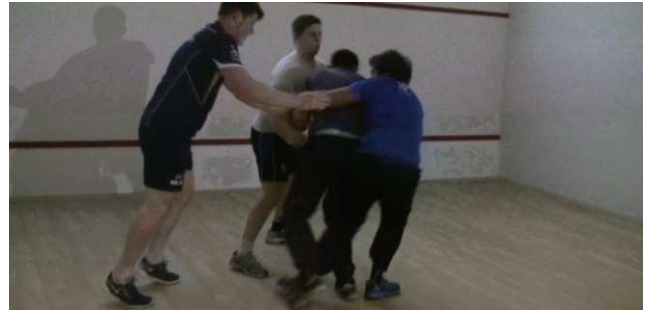
Figure 1. Attackers try to keep the 'it' player still in Bundle.

To detect how still a player is, or much they are moved by an attack, Bundle uses an accelerometer based algorithm. Because different devices (and even different phones across a single device family) have differing sensor noise levels or data rates, a custom filter algorithm is used to normalize across the phones. This first takes the raw accelerometer magnitude, median filters and high pass filters the data (both with 0.2 second time constants) to reduce sensor noise