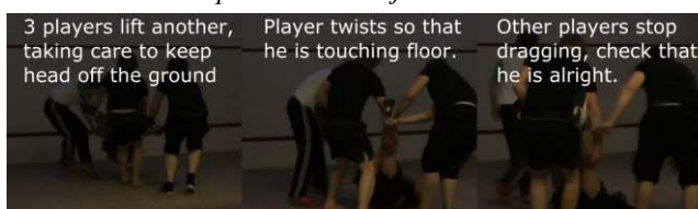
Figure 7. Player at risk, other players stop to check he is okay