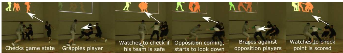
Figure 3. Arrow shows view direction over 6 seconds of BoP as the player switches between looking at screen and players.

these games was to encourage people to play physical games with each other, so the finding that players were too busy playing with each other to attend to the technology could be considered a success.