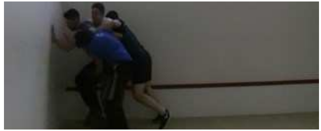
Figure 2. Players found it hard to escape the corner in Bundle

This theme describes participants' discussion of the physical space the game was played in. 59 of the total 771 units are characterized by this theme. Participants commented on the experience of playing highly physical games in a squash court that had hard concrete walls, hard wood floors and no padding. "Softer floor. It definitely needs mats I think," "softer walls maybe as well [rubs arms], laugh." However, there weren't any feelings of danger expressed over playing in that environment, "it wasn't too bad... I've just kind of got scuffed knees and things like that," "just makes it more fun," "the walls didn't