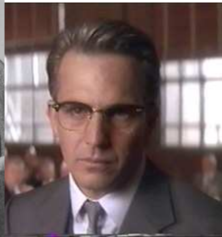
Figure 6: Kevin Costner as Garrison in JFK .