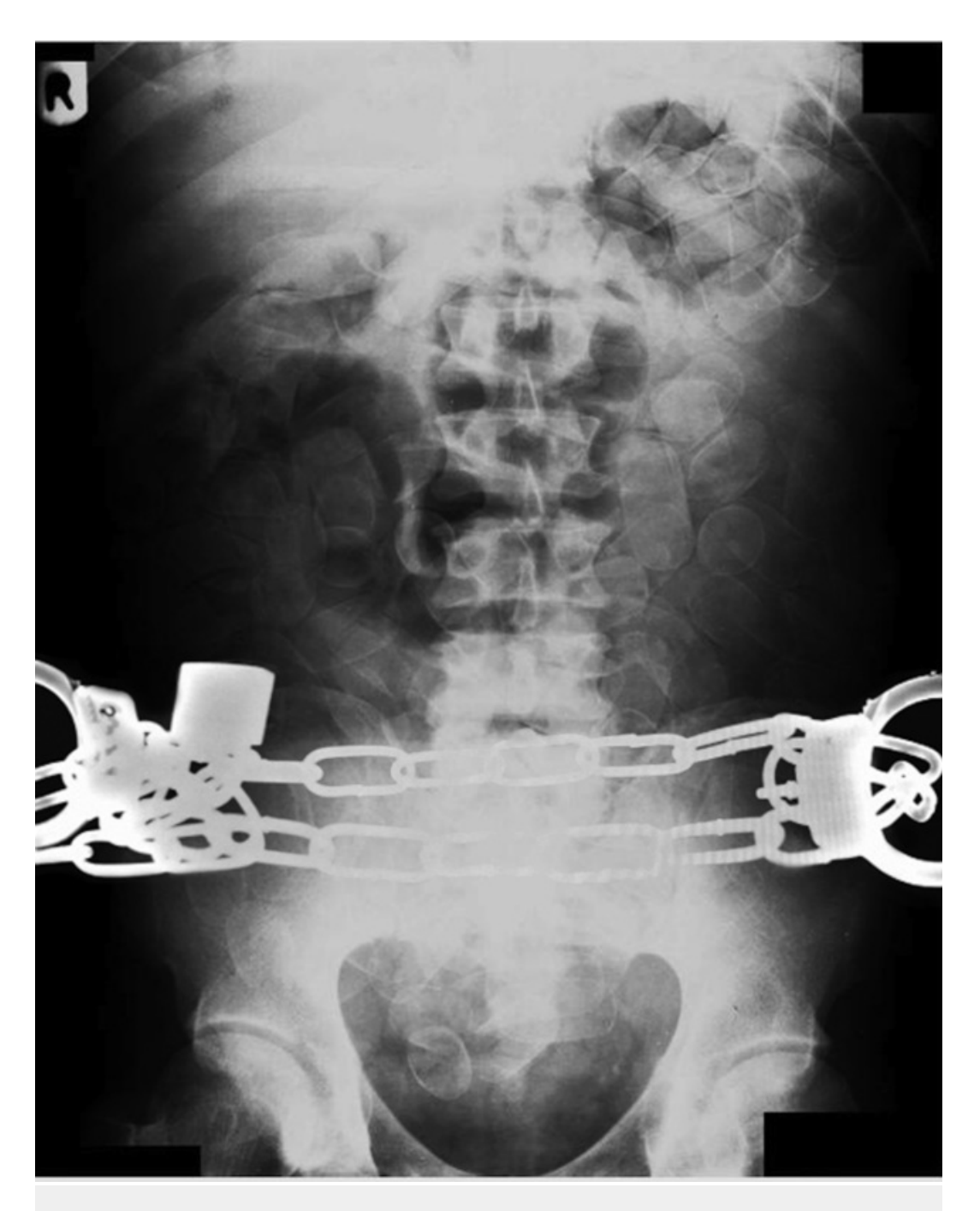
FIGURE 3: Synthesis of Figures 1 and 2, showing shackles as well as cocaine-filled packets in bowel