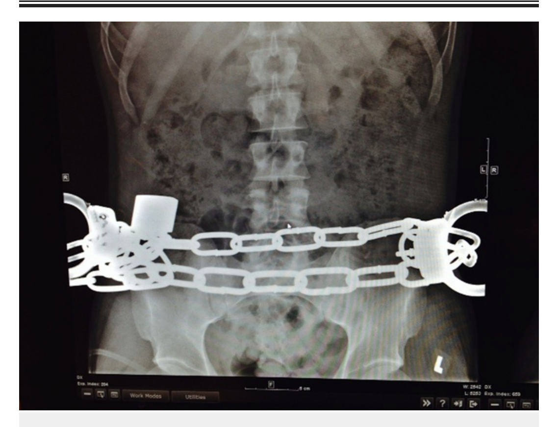
FIGURE 2: Normal abdominal x-ray image in hand-cuffed patient brought to Emergency from jail