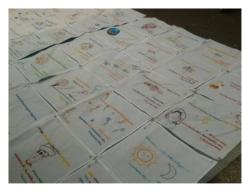
Figure 2: Words and Images in Zocaola de Puebla in Puebla, Mexico. June 26, 2013.