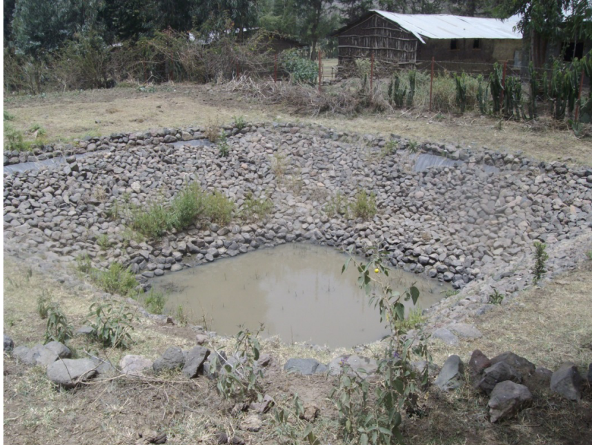
Figure 2. Photograph showing a water harvesting system in Tigray, a low-potential area (Asnake Mekuriaw, May 2012).

prepared a customary agreement governing the sharing of spring and stream water for different purposes, including supplementary irrigation. The committee also manages utilization of available water resources within the villages as well as between upstream and downstream villages.