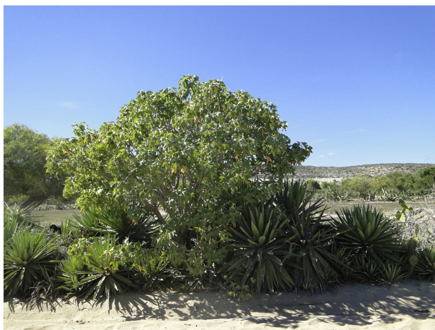
Fig. 1. Jatropha mahafalensis shrub in Soalara (south-west Madagascar).

To determine oil production potential, a mapping of existing hedges was done using GIS. The total length of hedges was calculated for the entire village territory and for an area within 3 km distance from the