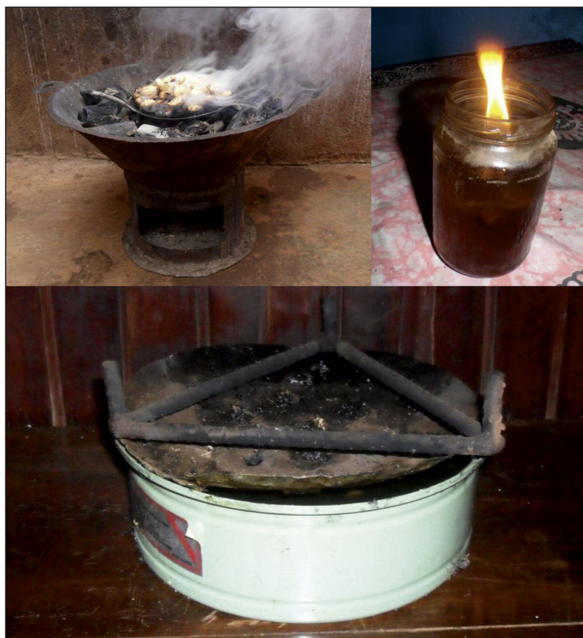
Fig. 4. Combustion of J. mahafalensis seeds in combination with charcoal in a conventional charcoal stove (top-left), oil using a wick stove for cooking (bottom) and a floating wick lamp for lighting (top-right).

In Table 6 we are calculating the number of days during which all households of Soalara could light a floating wick lamp during two hours, for example in the evening. We used the above estimates and 3 hedge replacement scenarios (10%, 50% and 80% of existing hedges in the considered area). The table shows that the highest replacement scenario (80%) would allow producing 6026 l of oil, which would last roughly 250 days, i.e., slightly more than two thirds of a year, if all households use a floating wick lamp during 2 h per day. Probably