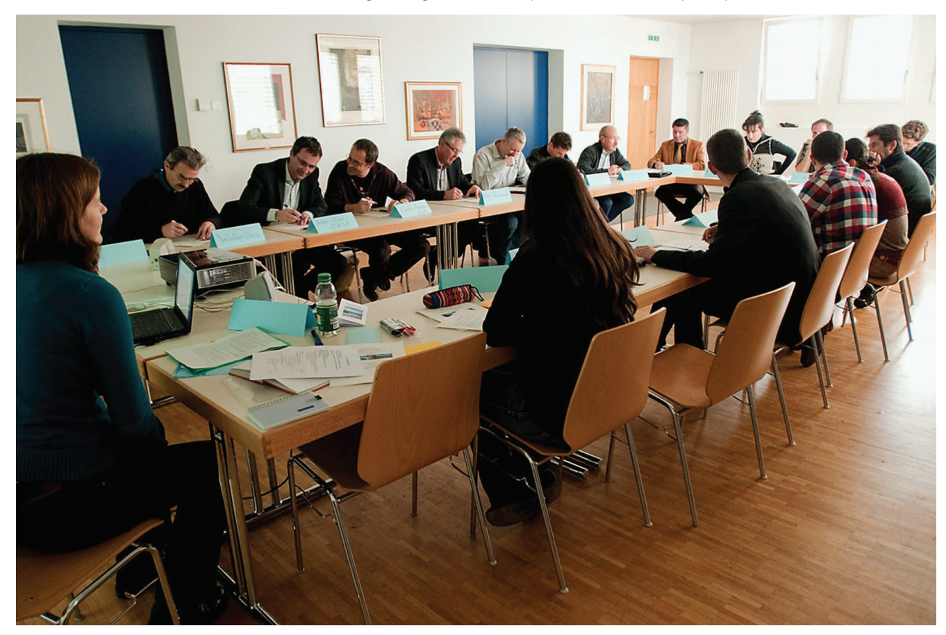
FIGURE 2 Stakeholders discuss sustainable water use strategies during a workshop in Veyraz, Switzerland.

transdisciplinary research in general and to the sustainable management of natural resources.