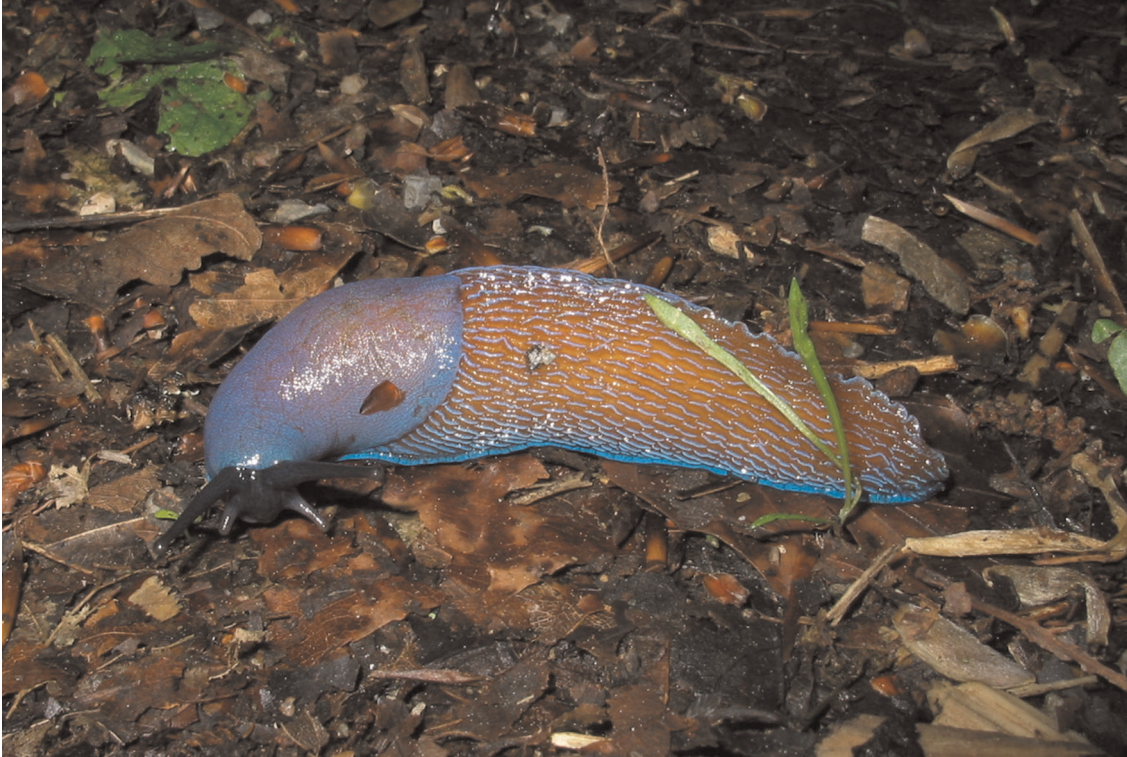
FIGURE 3 The endemic Carpathian blue slug, Bielzia coeruleans .

Carpathians (Kozak et al 2007a); for such studies, access to historic Austro-Hungarian maps is crucial.