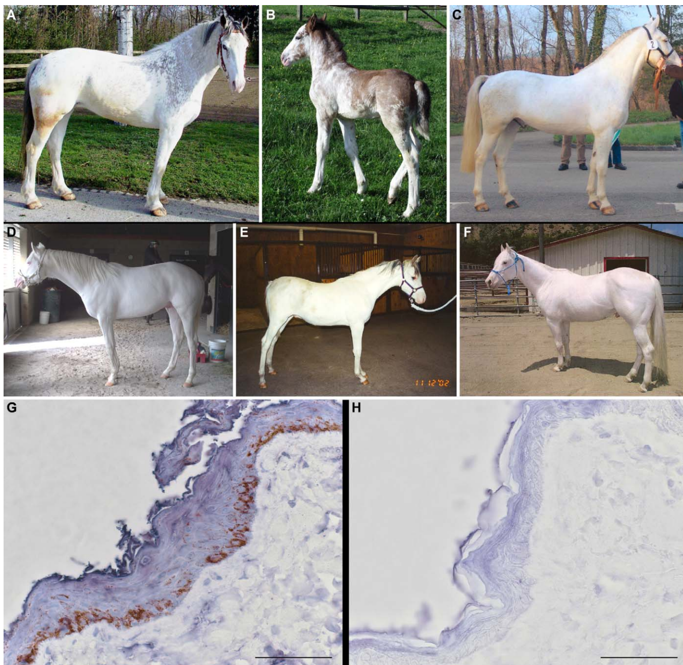
Figure 1. Dominant White Phenotype in Horses

(A) Franches-Montagnes mare with little residual pigmentation.