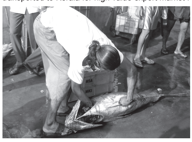
Fig. 2. Gillrakers and stomach being removed from yellowfin tuna

Rs. 80 per kg. Fishes were cleaned, gill rakers removed and degutted (Fig. 2). The cleaned fish were transported to Kerala for high value export market.