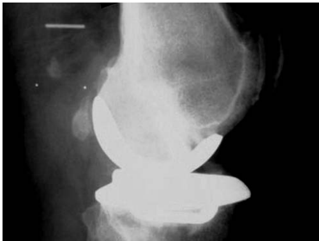
Fig. 3.- Lateral radiograph shown a posterior dislocation of the meniscal bearing PE implant

He was taken to the operating room and his unicompartmental knee was revised to a primary total knee arthroplasty (AGC Knee, BIOMET)(fig.4).