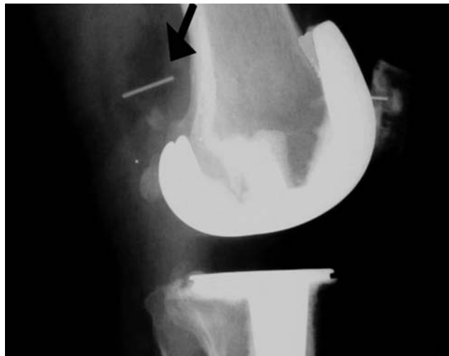
Fig. 4.- Leaved in the popliteal fossa, see the arrow, and replacement for total cemented arthroplasty prosthesis.

What called our attention of this case was that the UKA worked well during the surgery and the first weeks, and suddenly it dislocated. We didn't want to convert to a TKA in the first place, because we