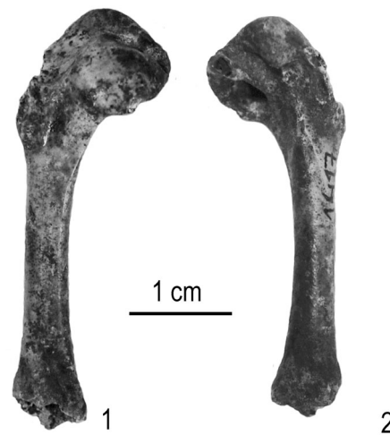
Figure 3. Humerus of Cyanoliseus ensenadensis FC-DPV-1417. 1, cranial view; 2, caudal view / húmero de Cyanoliseus ensenadensis FC-DPV-1417. 1, vista cranial; 2, vista caudal.

The other fossil parrot described here belongs to