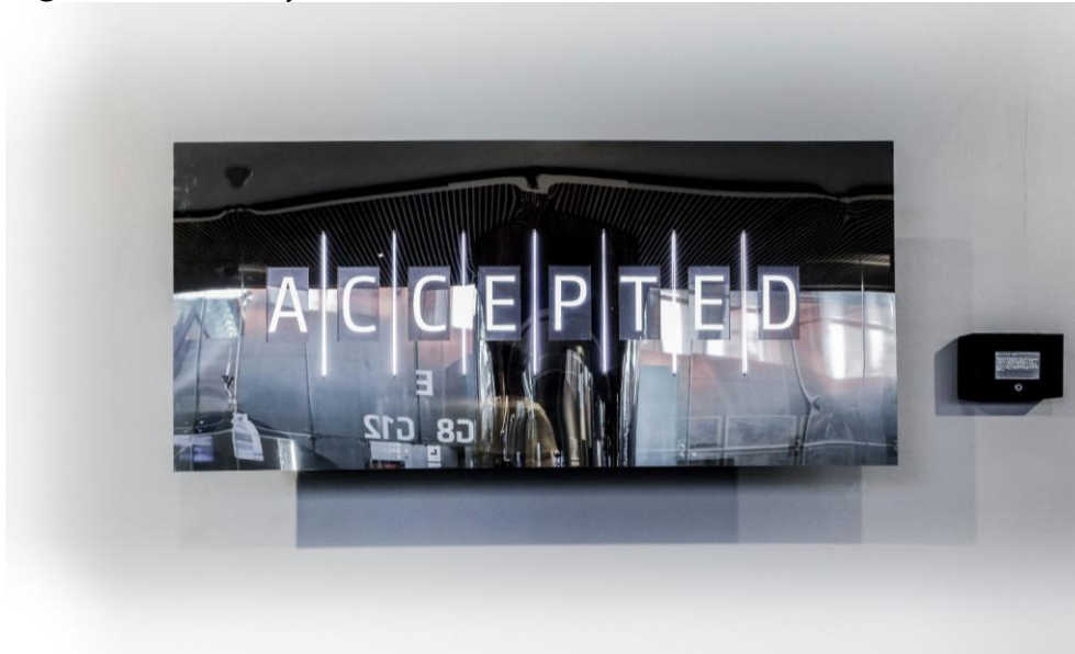
Figure 6. Variable (from an exhibition)

With the use of the Machine Learning algorithm, a new title and a statement is generated instantly as soon as a person interacts with the artwork. Simultaneously, the generated title word is split into its letters and they are placed on each of the display screens separately accompanying a flowing text animation. Since the new generated texts are commonly contained with ontological questions based on the concept of "being," the frequent use of the words "being" are replaced by the generated artwork's titles with a string operation. Correspondingly, the artistic statement encapsulates a new ontological content that discusses on a new title for the artwork based on Heidegger's philosophical point of view.