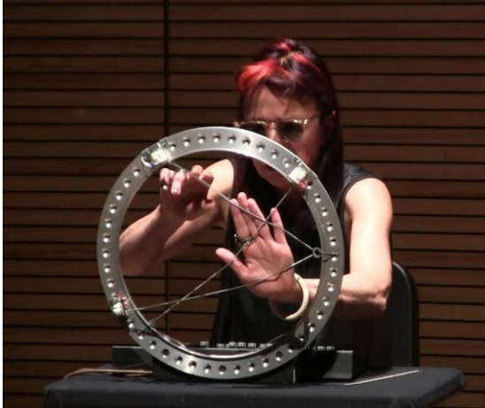
Figure 1. Spring Spyre by Laetitia Sonami

Similar to Sonami, Gene Kogan is an artist working with programming skills to find cross sections of computer science with arts. Kogan has been working on developing a free educational resource "ml4a" for artists who would want to integrate machine learning into their art projects. In addition to his academic activities, Kogan creates distinctive works of art with extensive machine learning influence. Kogan's artwork titled Doodle Tunes 8 enables the users to turn simple hand drawings of musical instruments into computer-based sound sample players (Figure 2).