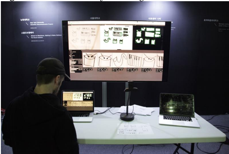
Figure 2. Doodle Tunes by Gene Kogan

Kogan implements convolutional neural networks to analyze the hand-drawings with computer vision techniques and classifies them into musical