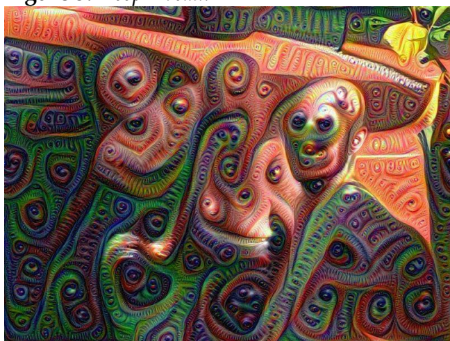
Figure 3. Deep Dream