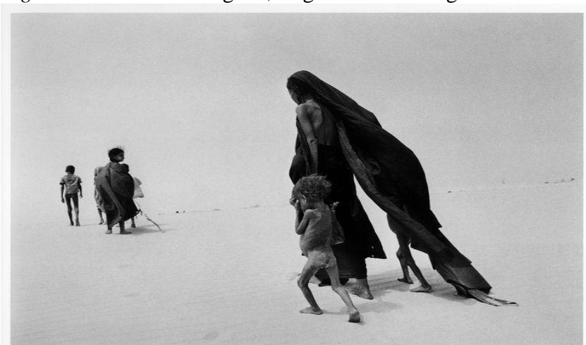
Figure 11. Sebastiao Salgado, Region of Lake Faguibine

These roads serve the purpose by connecting borderland residents and activities. It is an unbelievably long journey! I must say that I admired and appreciated the road construction workers who strenuously built the roads at the borderlands in every weather condition I came to witness. Without these roads, journey in this vast borderland region would be harsh and unthinkable!