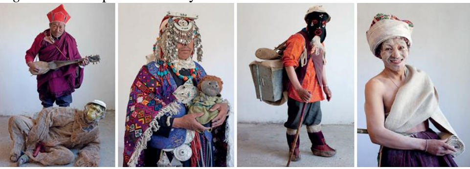
Figure 4a. Disciples of a Crazy Saint