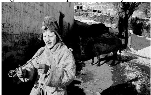
Figure 4b. Disciples of a Crazy Saint