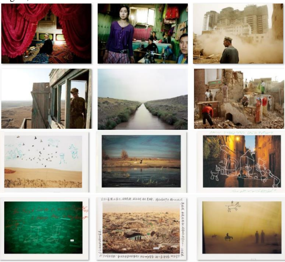
Figure 6. Documentary Photography by Carolyn Drake - Uyghur Autonomous Region, China

their own dreams in Islamic belief, and then ask people to leave messages in the journal and, finally, have people draw and sketch on her own printed photographic works. This would allow her to have less control over the imagery and mix it with someone else's narrative.