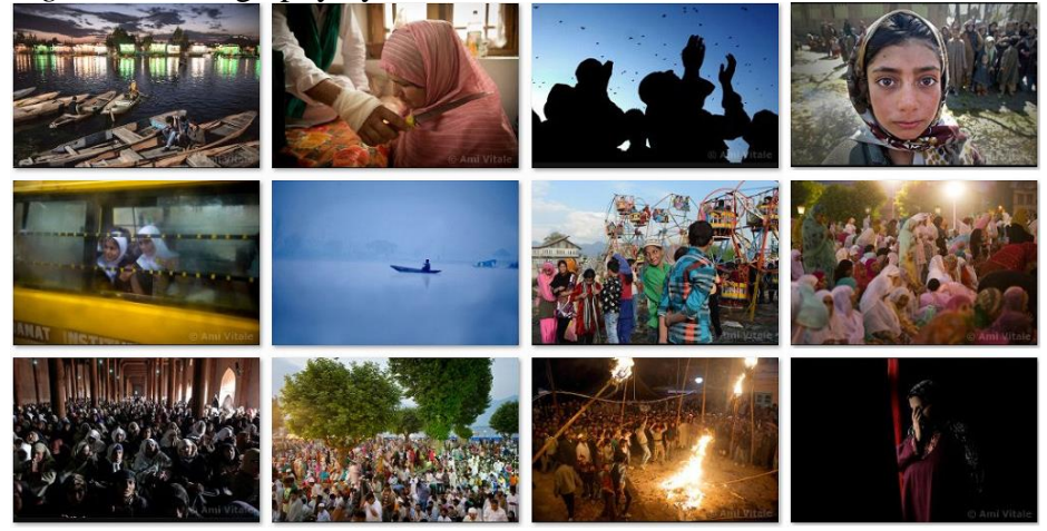
Figure 5. Photography by Ami Vitale - Kashmir, India

My early phases of documentary and practical photographic works with documentary approaches (Figure 7) are rather similar to Ami Vitale's ideas of covering the borderlands. We do not seek the sensational and stereotyping war conflict visual. Both history and cultural background contributed a large context behind the content, where we spend a long period of time or frequently revisit, to understand the phenomenal and the ordinary in the same place.