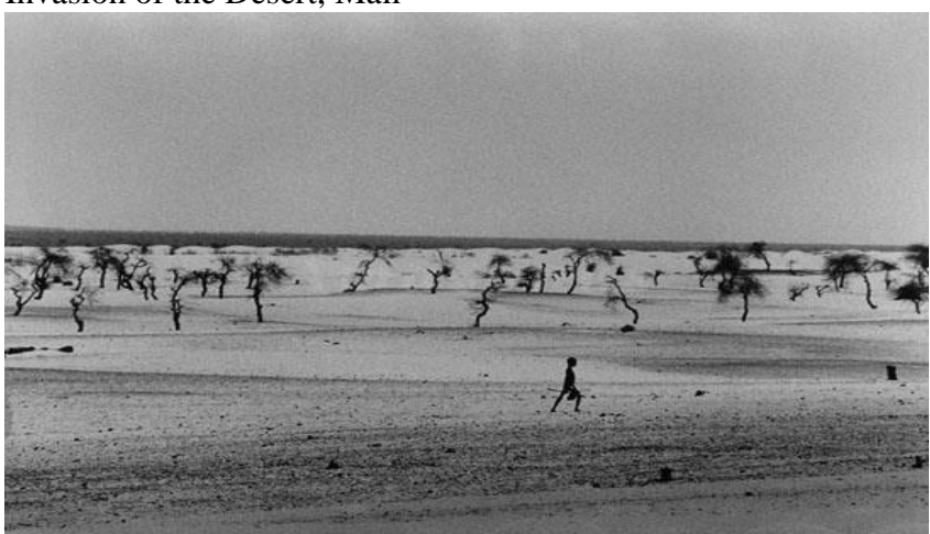
Figure 12. Sebastiao Salgado, Lake Faguibine Dried up with the Drought and Invasion of the Desert, Mali