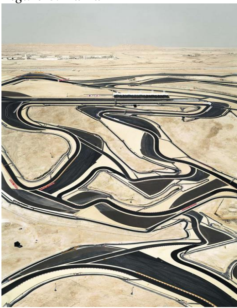
Figure 8. Bahrain I