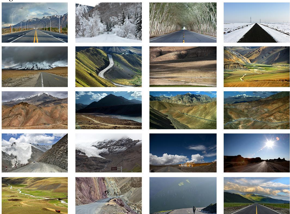
Figure 13. On the Road