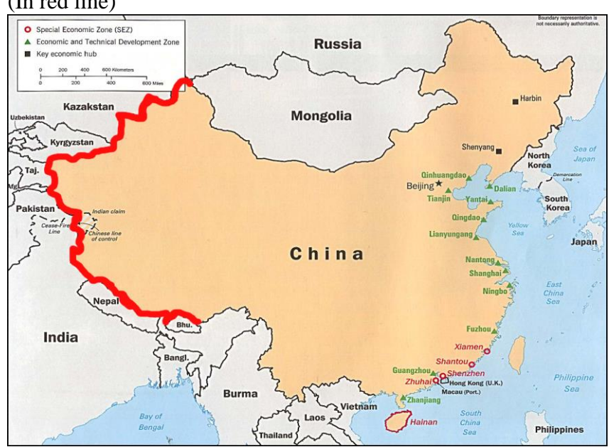
Figure 1. Photographing the Area from Western China to the Himalayan Region (In red line)

the cultures, humans and nature, along these vast borderlands and to make a synthesis of the sense of fact and personal truth in producing creative artistic photographic works. The resultant photographic works are not the utmost important goal; rather, the process of discovery and reflection of the discovery are more crucial to this research. I intend to explore and capture the moment of borderlands encounters in an ambiguous and irresistible way for the viewer to ponder, which no other photographers have yet done in borderland photography. This research would envision compositions that would open up new boundaries and expression in photography. The process of discovering a new way to interpret the borderland is of the utmost importance in this research.