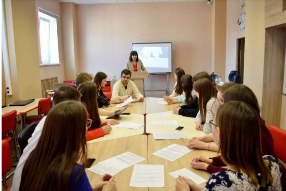
Fig. 1. Implementation of discussion technologies in the study of the course "Project activity of the teacher of vocational training"

The test results of the first two groups are shown in figure 2.