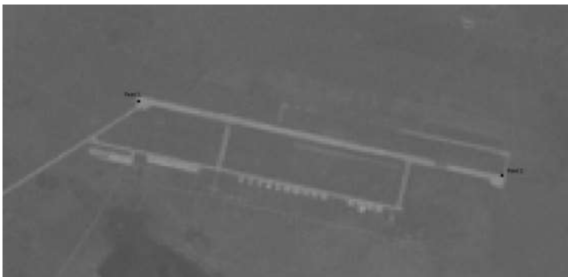
Figure 2. Searched points 1 and 2 on the scene of imagery