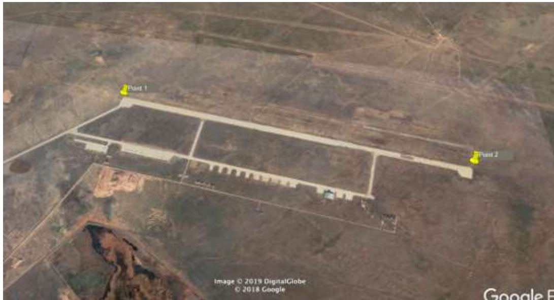
Figure 3. Searched points 1 and 2 on Google Earth maps

we obtain the geographical coordinates of this point in the imagery, and compare them with the desired point in GIS Google Earth (Figure 3).