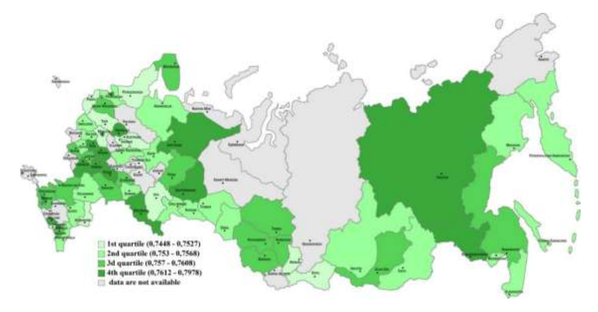
Figure 2. Ranking Regions According to the Regional Environment Impact Factor

can make a ranking according to the degree of influence of individual regions (figure 2).