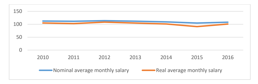
Fig. 1. Growth rates of real and average monthly wages of workers in the whole of the Russian Federation (in% of the previous year)

As can be seen from figure I, the nominal average monthly wage for the last six years, although it had a positive growth rate, as a whole, tended to decline, in other ways, as well as the real one. This is because, under the conditions of continually growing inflation, the size of real wages will still decline, even with an increase in the nominal wage level. This is observed with an artificial increase in wages through forced indexation by the state. At the same time, the degree of satisfaction with the social situation in the population is decreasing.