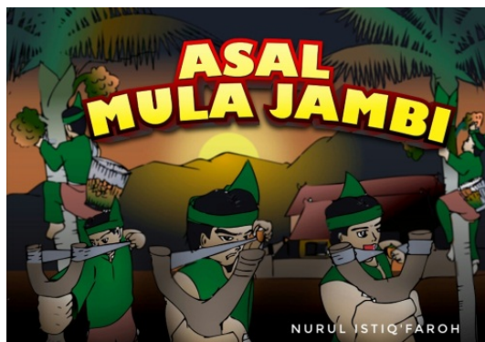
(a) The Origins of Jambi

Kolmogorov-Smirnov was used to test the normality of pre- and post-test data. After fulfilling the assumptions of normality and homogeneity ( p > .05 ), parametric statistics were used. The score of reading comprehension and motivation were analyzed using paired-samples t -test. Then, the magnitude of the increase in pre-to-post-test scores was checked using n-gain formula (Hake, 1999); high, g \geq .70 ; medium, .70 > g \geq .30 ; and low, g < .30 . In addition, the independent samples t -test was used to investigate whether there was a difference in scores on reading comprehension and motivation between the experimental and control groups. t -Tests were calculated in SPSS version 20 program and .05 significance level was used.