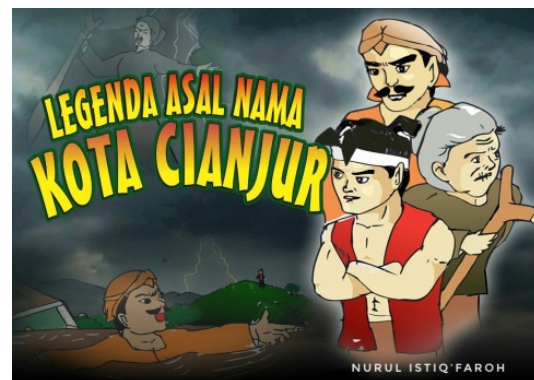
(b) The Origins of Cianjur