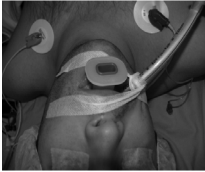
Figure 1: Adhesive tape technique for securing endotracheal tube