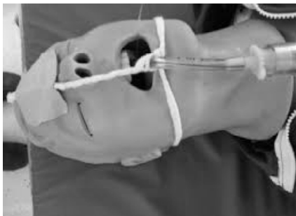
Figure 2: Bandage technique for securing endotracheal tube

study. Informed consent was obtained from the participant relatives.