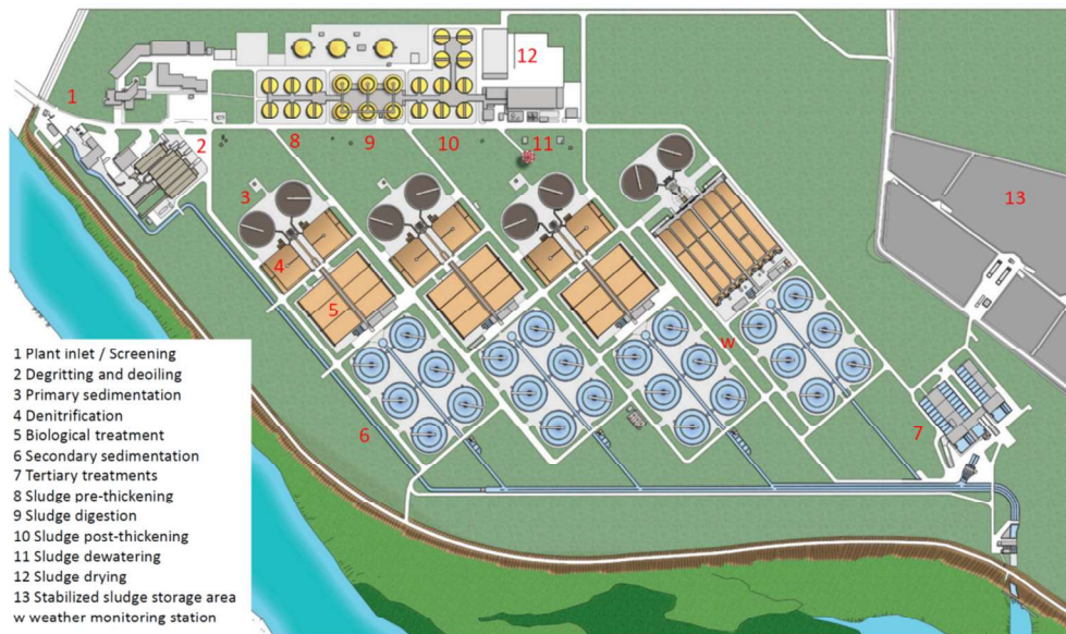
Figure 1: Plant of SMAT's WWTP [9].

SMAT's centralized civil WWTP is the largest chemical, physical and biological treatment plant in Italy. The plant treats municipal and industrial wastewater with a capacity of more than 2,000,000 of equivalent inhabitants. It consists of four lines devoted to the wastewater treatment and one line for sludge treatment. The water line, with an average flow rate of about 25,000 m 3 /h, is made up of the following processes: grid screens, grit and grease removal, primary sedimentation, pre-denitrification, biological treatment, secondary sedimentation, phosphorous removal and final filtration (Fig. 1).