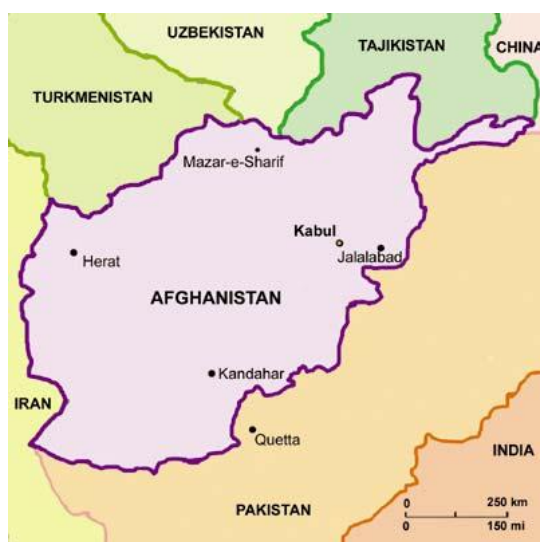
Figure 1. The map of Afghanistan and the surrounding countries.