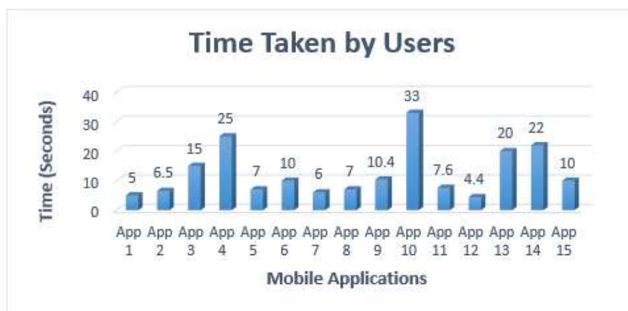
Figure 1. Time is taken by users

Figure 1 shows the average time taken by children to complete the task given to them. The application Step by Step Salah has taken the highest time. Because the task set of this, the application was to find rakat (it consists of the prescribed movements and words followed by Muslims while offering prayers) table. Children were asked about the number of rakats in Namaz - e – Zuhar (It is the name of one of the ritual prayers of Muslims performed in the afternoon). They were unable to answer the numbers of rakats properly because they didn't understand the numbers of rakats in table format. Therefore, this application took the highest time as compared to other applications. The lowest time has been taken by the Wudu and Salah application since it was easy to operate the application due to the simple and easy interface.