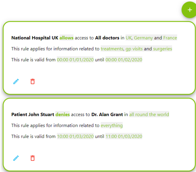
Figure 2: Access Rules definition interface

Patients have control over their personal clinical information , so they decide how their information will be available. This makes it necessary to provide the means to customise access rules in a intuitive manner . This requirement is fulfilled by a formal language for the permission rules, which is hidden underneath an interface that enables patients and other authorised users to manipulate these rules in natural language (Figure 2). The verification of access rules follows a logic-based approach enabling conflict-free layers of authorisation, with priority levels guided by government laws, organisation policies and individual rules.