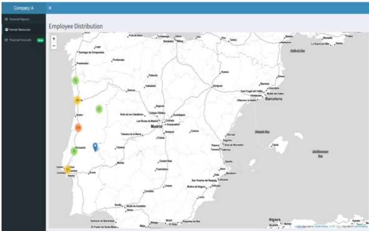
Figure 5 - Example of the dashboard produced by the BI system, showing employee distribution