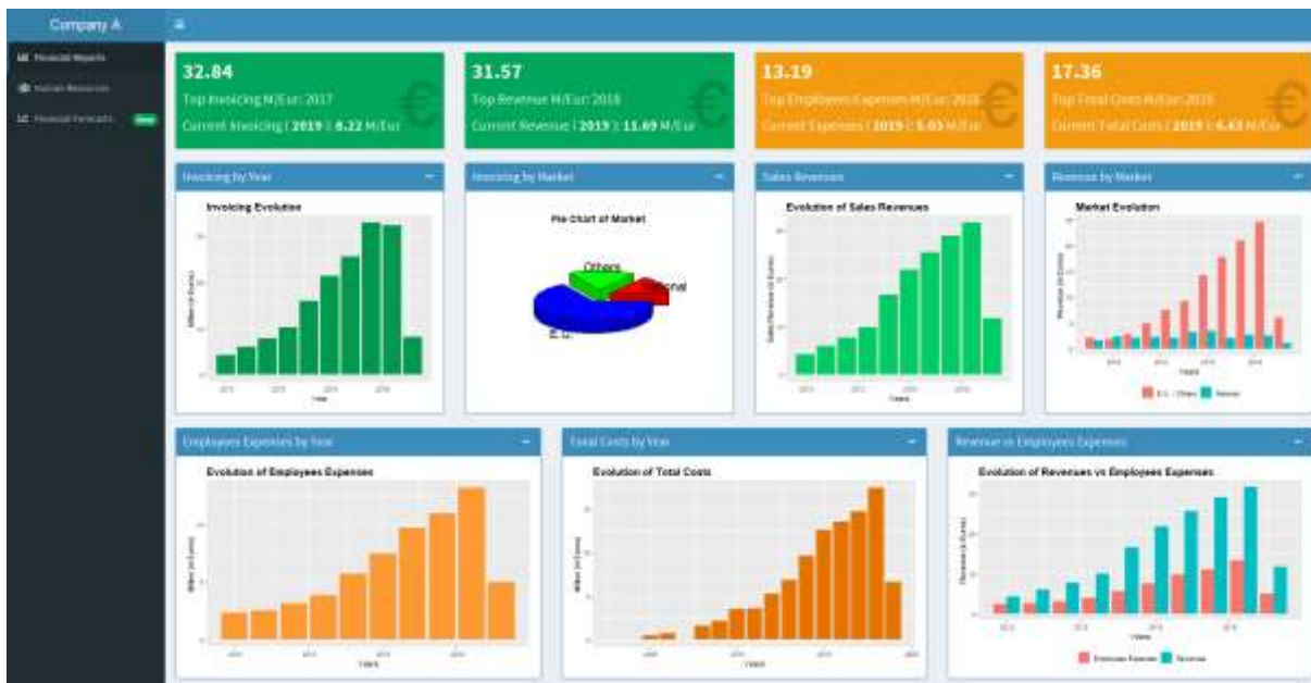
Figure 4 - Example of the dashboard produced by the BI system, showing financial reports

Figure 4 shows a screenshot of an example of a dashboard produced by the BI system proposed. One of the objectives of the prototype is to provide a BI tool that makes it possible to analyze data in an easy and intuitive way. As shown in the figure, in the first tab there are charts that display the evolution of billing per year, by market, personnel expenses and revenues over the years. There is a second tab that shows employee distribution, facilitating the analysis of geo-referenced data. The third tab will show forecasts, produced using AI algorithms. The AI algorithms are presently being implemented. They will allow to make projections for the future.