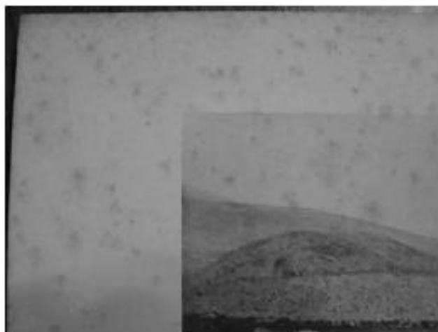
Figure 1 : Foxing spots in a photograph from HAML P

Samples were taken from the surfaces of photographic paper with fox-like reddish-brown colour spots, type “foxing” (Figure 1) in the Historical Archive of the Museum of La Plata (HAML P), Argentina, with sterile cotton swabs. They were homogenized in 10 ml of sterile saline and inoculated on Plate Count Agar (PCA media) for to grow heterotrophic mesophilic bacteria [17,19,26] . Bacteria were typified according to the Gram stain and biochemical tests [36] . Bacillus spp. were identified by molecular techniques (16S rRNA gene), with NCBI accession number EU184084 = Bacillus sp. and NCBI accession number AM747224 = Bacillus thuringiensis [19,20] .